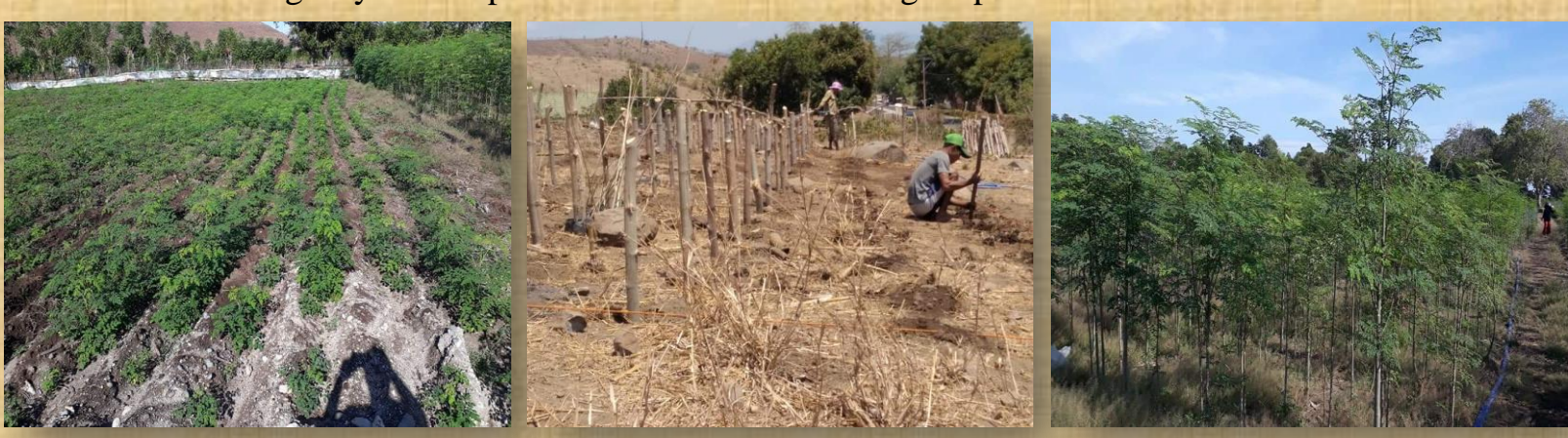
Location in Kramat Village, Kec. Kilo, Kab.Dompu, West Nusa Tenggara

Currently CV. Tri Utami Jaya is developing the Moringa plants cultivation sector of all sub-districts / regencies in West Nusa Tenggara by forming partners of 20 Moringa Plant Farmers Groups in each of 10 Districts with a total of 400 members of Moringa Farmer Groups spread across 10 Districts / West Nusa Tenggara Regency and 50 production workers including 10 permanent workers in it.