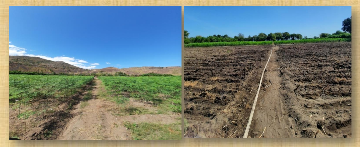
Location in Kramat Village, Kec. Kilo, Kab.Dompu, West Nusa Tenggara

Until now, the Moringa Farmer Group has been planting Moringa in Kilo District, Dompu Regency, West Nusa Tenggara with a target area of 100 – 1.000 hectares (100 hectares have been realized)