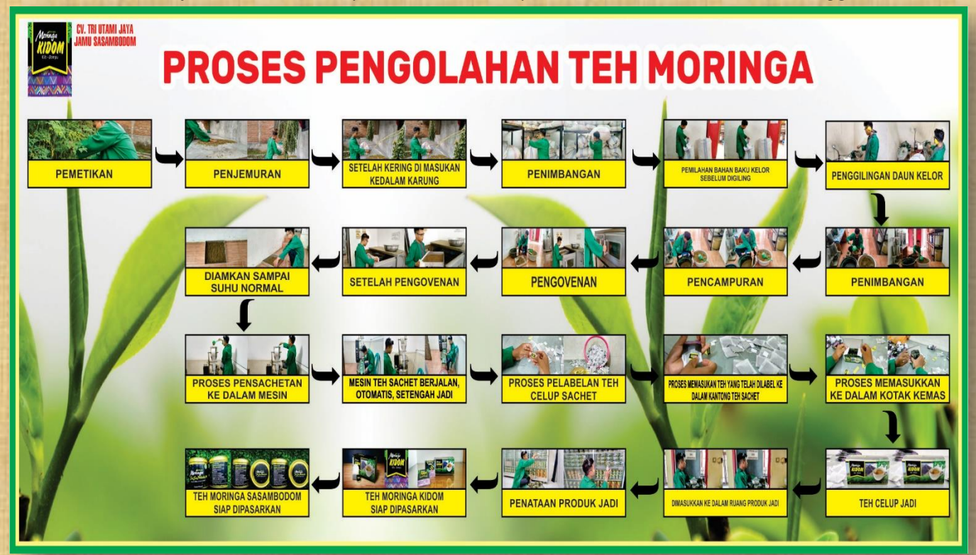
The processing of products made from moringa raw materials from raw material warehouse, milling, mixing, oven, packaging and finished products

The location of the Production Plant in Mataram, West Nusa Tenggara starts from the process of gathering raw materials, processing semi-finished materials using a milling machine, oven to packaging using an automatic machine with a capacity of 4,200 sachets / hour.