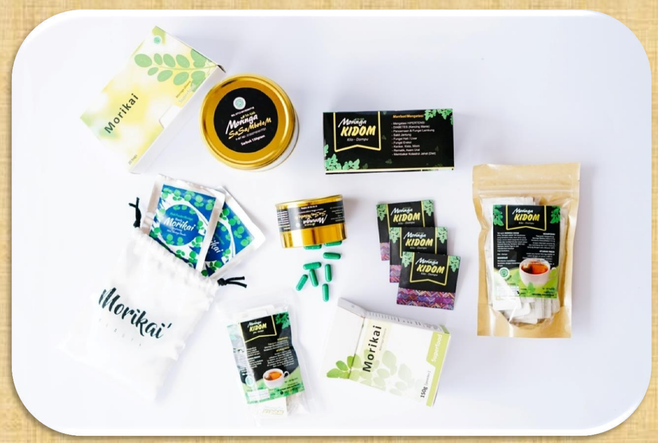
"Local Is The New Global"