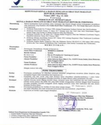
SK POM TR MORINGA KIDOM