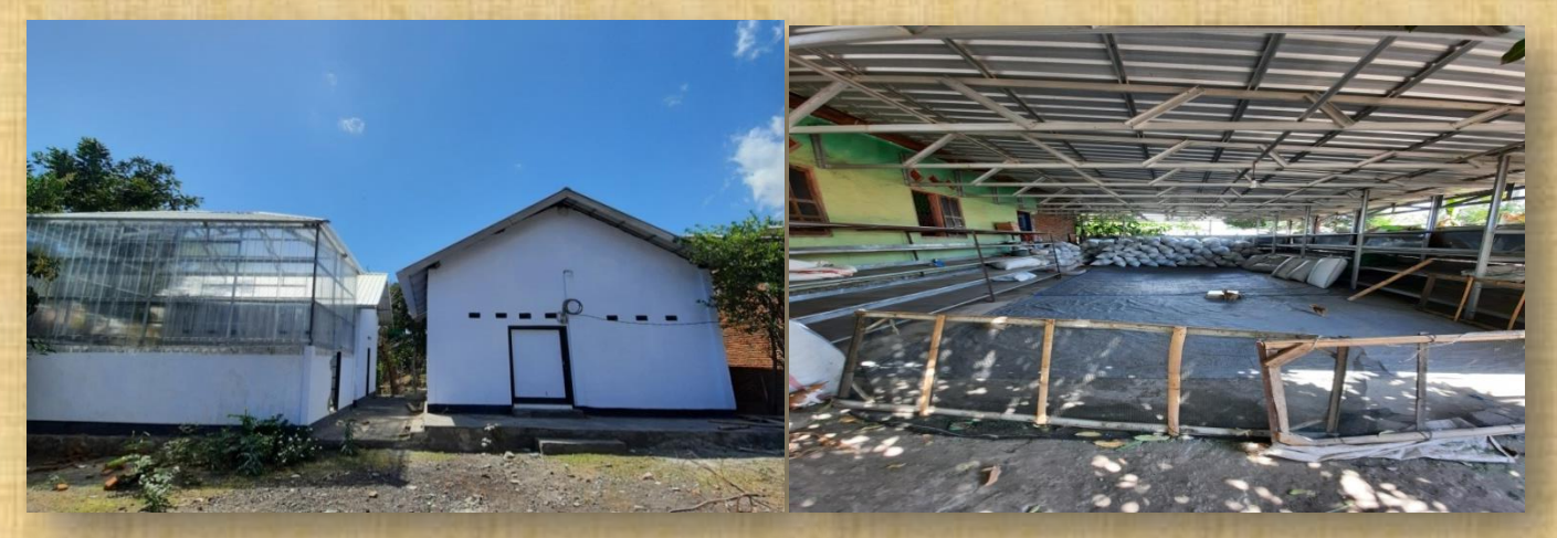
Location of Raw Material Drying (Green House), Machinery Warehouse, and Moringa Raw Material Sorting Warehouse

CV. Tri Utami Jaya has a production plant in Mataram City, and a Moringa Raw Material Collection Warehouse in Kilo District, Dompu Regency, West Nusa Tenggara