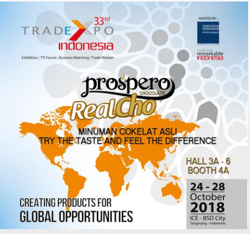
MINISTRY OF COOPERATIVES AND SMES