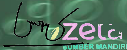
D Galih Wijaya Director

OFFICE : MANGGALA WANABAKTI BUILDING BLOCK IV, WING C, 8 FLOOR NO.30 JL. GATOT SUBROTO, SENAYAN JAKARTA PUSAT 10270. INDONESIA