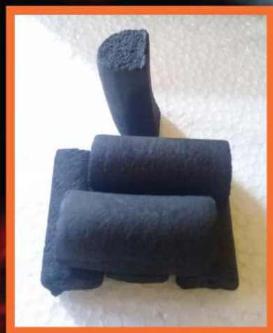
Finger Flat Size 15 x 50 mm