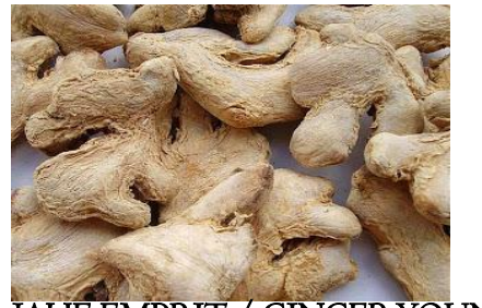
JAHE EMPRIT / GINGER YOUNG

Other Agriculture Products - Color Yellow, Red Dimension 10 - 25centimeters