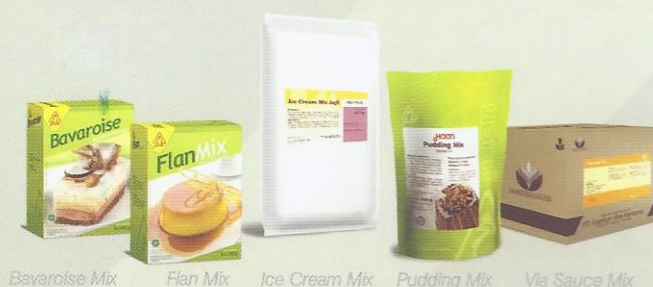
Bavaroise Mix Flan Mix Ice Cream Mix Pudding Mix Vla Sauce Mix

Sweet and tangle dessert series from Haan offers various kind of pudding mix, flan mix, ice cream mix, bavaroise mix, also vla sauce mix. Surely indulging your sweet tooth