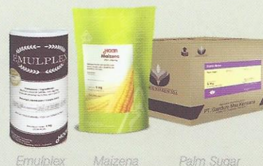
Emulplex Maizena Palm Sugar

On top of our dessert, confectionary mix and specialty sugar, Haan also produced different product like thickening agent, dough conditioner and active baking powder that generally goes well with desserts, cake, and cookies