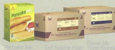
Pancake Mix Self Raising Flour Donut Mix - Yeast Raised

Understanding the needs of our customer, we providing various kind of confectionary mix that precisely can save time and energy. With special formula and ingredients, many kind of application can be made from it