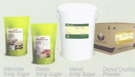
Blanchia Icing Sugar Fiesta Icing Sugar Velvet Icing Sugar Donut Dusting Powder

Haan Specialty Sugar Series offers various specialized icing sugar also decorating sugar. With the right composition of taste and form, certainly fulfilled the different segment of market