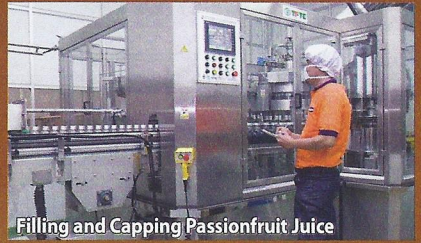
Filling and Capping Passionfruit Juice