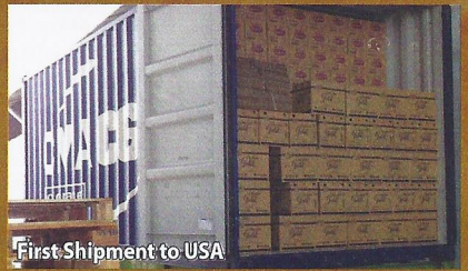
First Shipment to USA