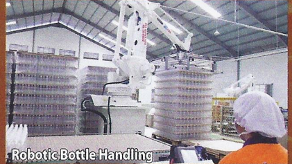
Robotic Bottle Handling