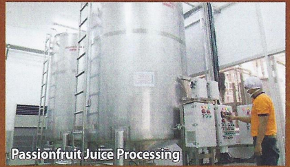
Passionfruit Juice Processing