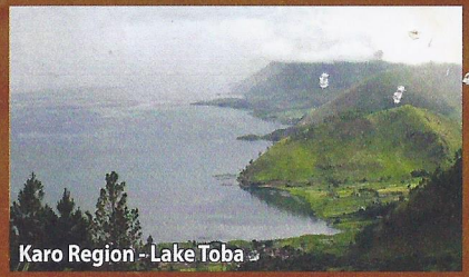
Karo Region - Lake Toba

We have implemented GMP (Good Manufacturing Practices) to create the safe work space, to produce hygienic products, and to fulfill customer's satisfaction.