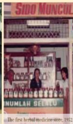
The first herbal medicine store, 1952