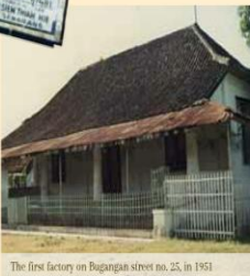
The first factory on Bugangan street no. 25, in 1951