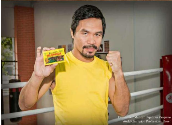
Emmanuel "Manny" Pacquiao World Champion Professional Boxer